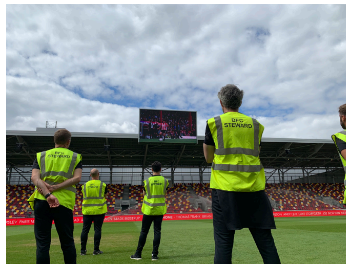
BFC stewards in the stadium ahead of pre-season friendly.

For televised games, staff from the broadcaster will also be present. The Club will need to secure an updated safety certificate in order for a limited number of supporters to be allowed inside our new home (whilst meeting social distancing guidelines).