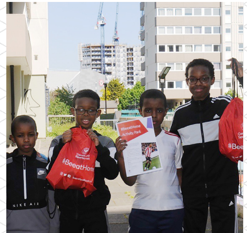
Brentford FC Community Sports Trust's #Beeathome campaign