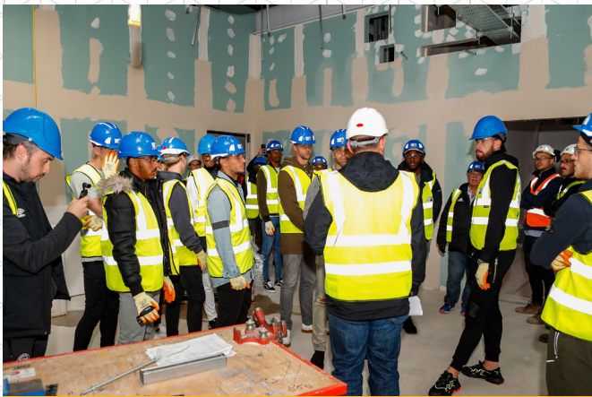
Brentford FC players in what will be their new dressing room.