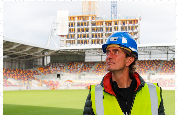
Head Coach Thomas Frank visits the new stadium for the first time.