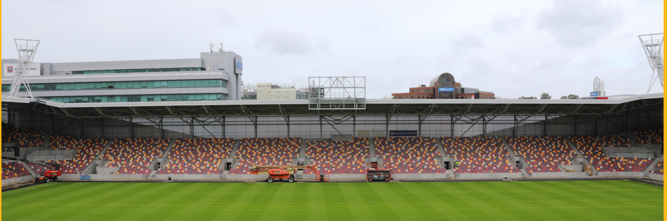
Internal photo of the stadium.

Welcome to this latest issue of the Brentford Community Stadium newsletter which provides an update on recent construction progress and what you can expect to see in the next few months.