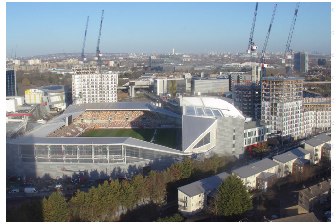
View of the stadium and wider development site, looking east (January 2020).

extension to the Lionel Road South temporary road closure. To facilitate these ongoing works, permission has been granted by the London Borough of Hounslow for the closure to be extended until 31 August 2020. The road will remain open to pedestrians and cyclists (although cyclists will need to dismount for safety reasons) and will continue to be closed to cars, motorcycles and other vehicles.